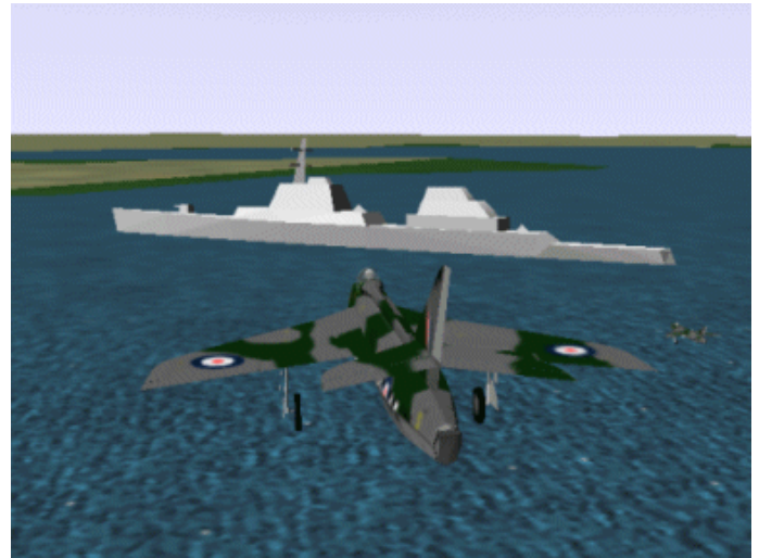
Distributed Simulation with Air/Maritime Interaction

Whether a ground up development or customisation of an existing product, Permian Defence Systems will apply its domain understanding and structured approach to produce an optimum solution to your requirement.